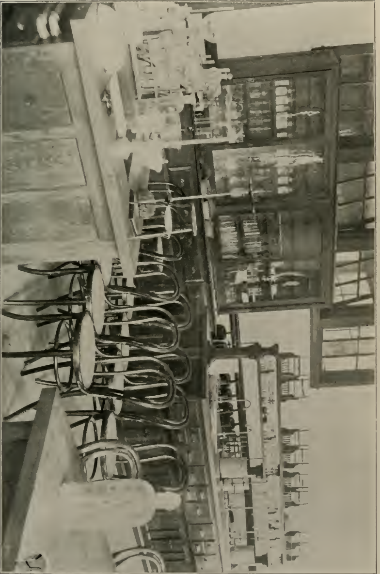
A SECTION OF THE LABORATORY.