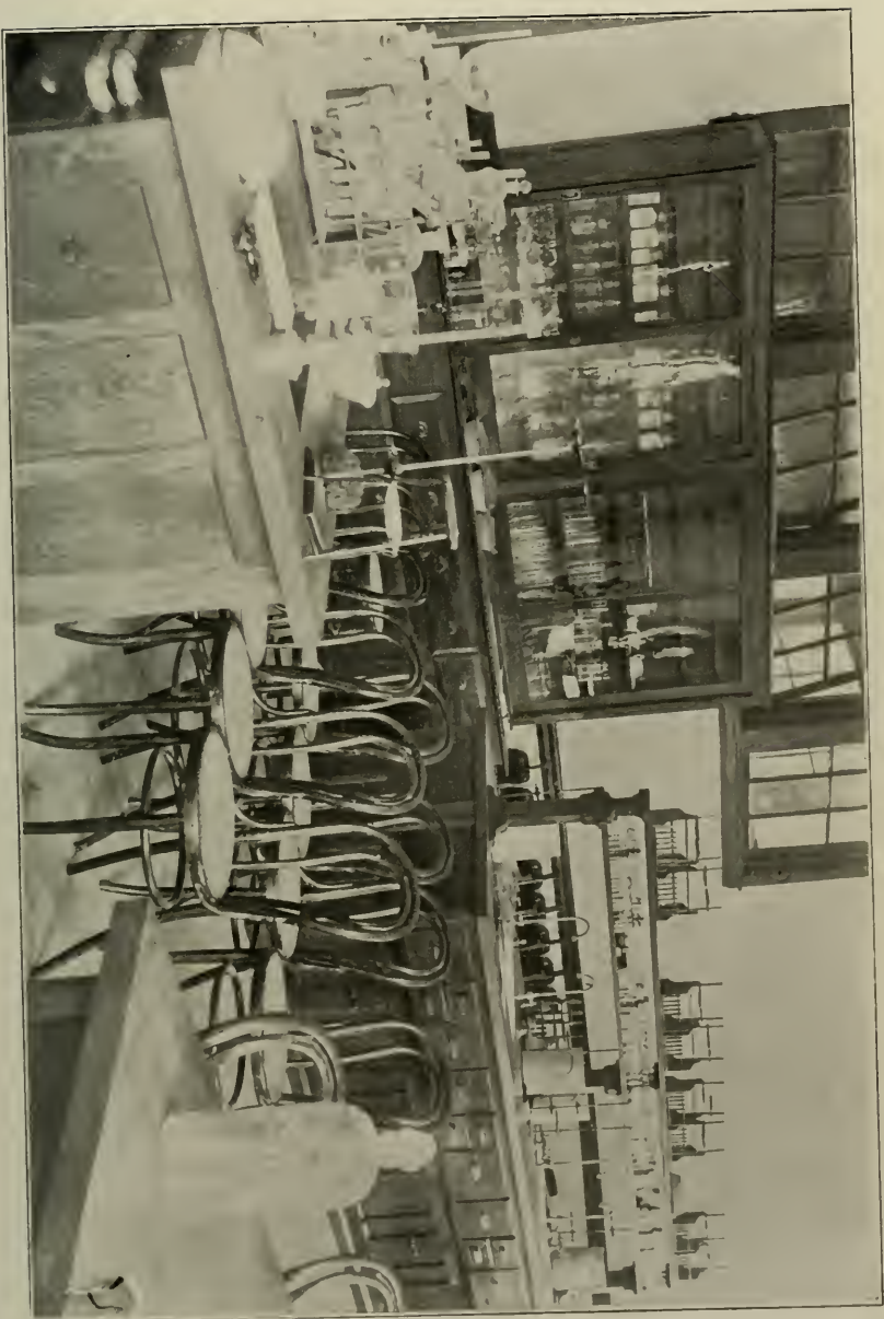
A SECTION OF THE LABORATORY