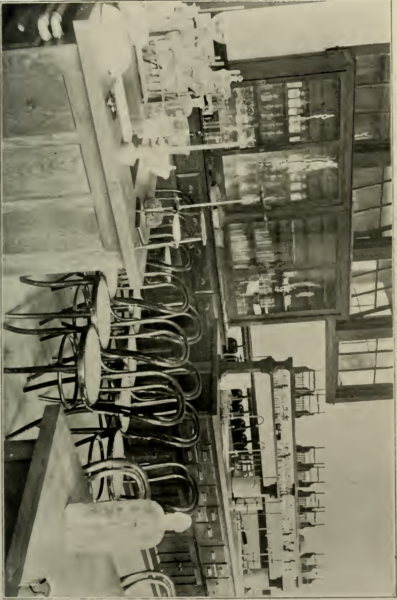
A SECTION OF THE LABORATORY