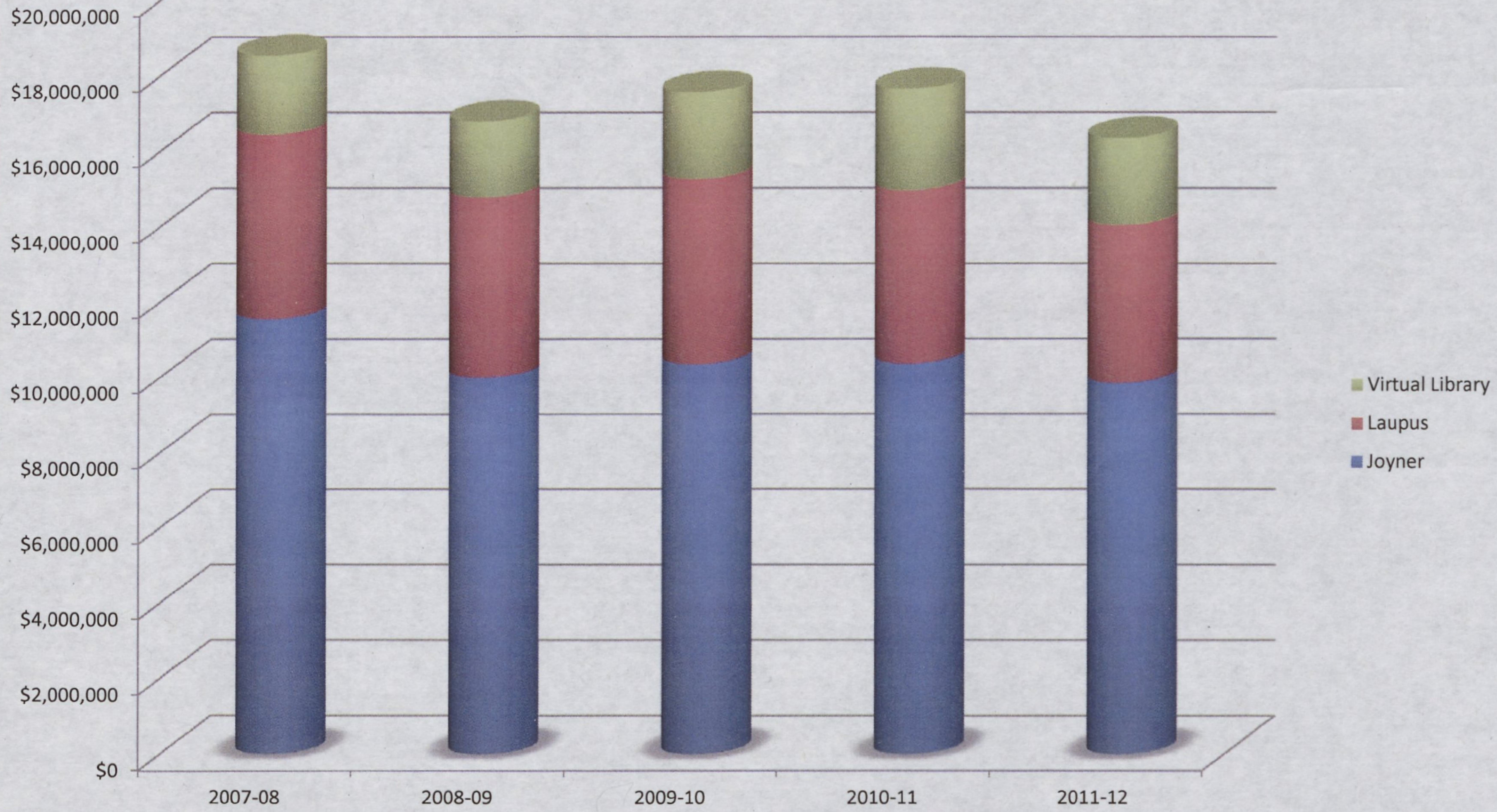
ECU Libraries Budgets 2007-2012