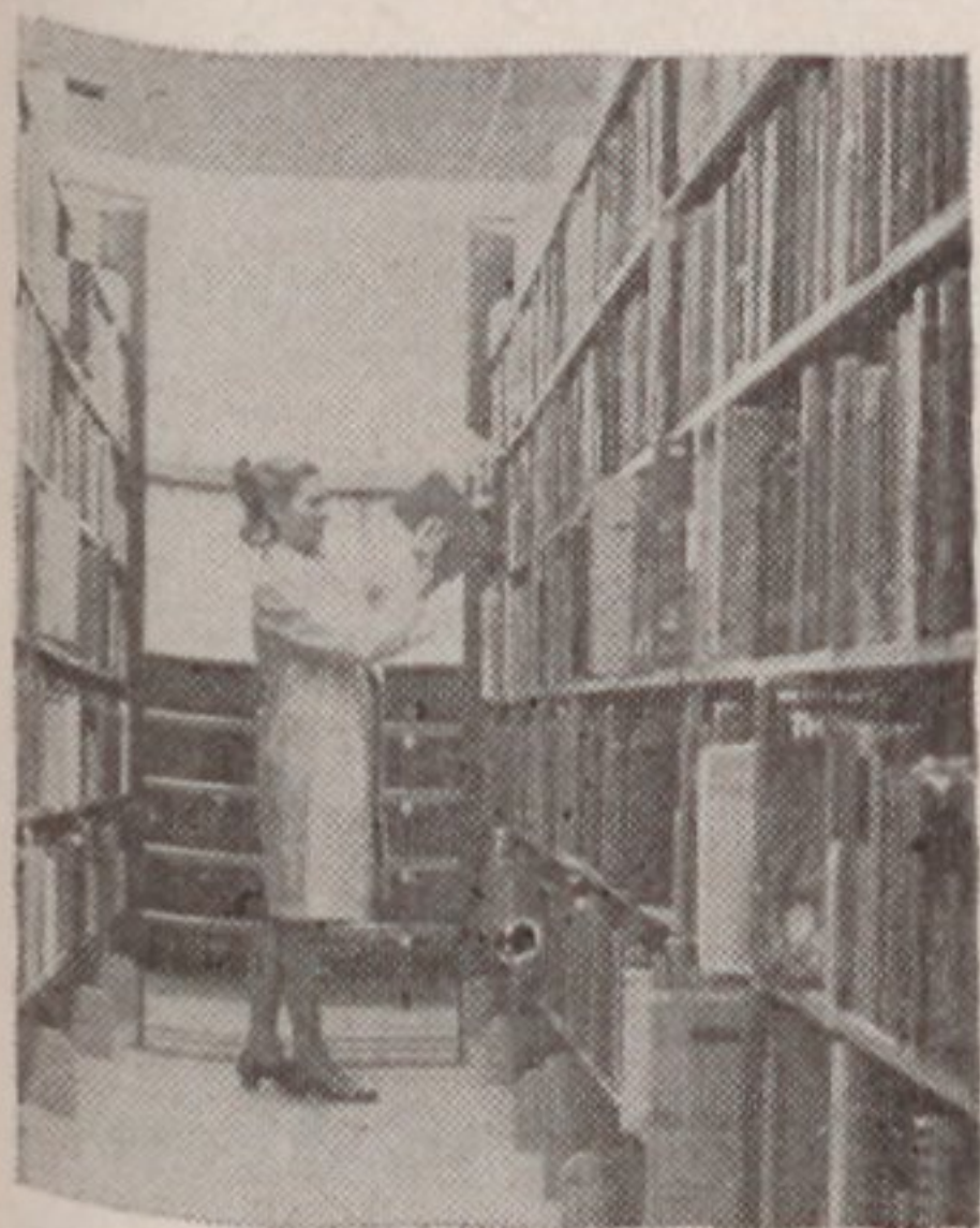
Mary Livermore Library at Pembroke State University.