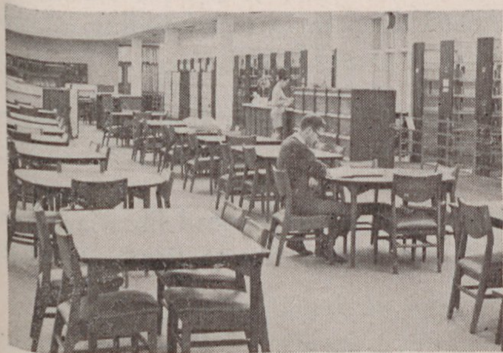
Main reading room at Mary Livermore Library at Pembroke State University.