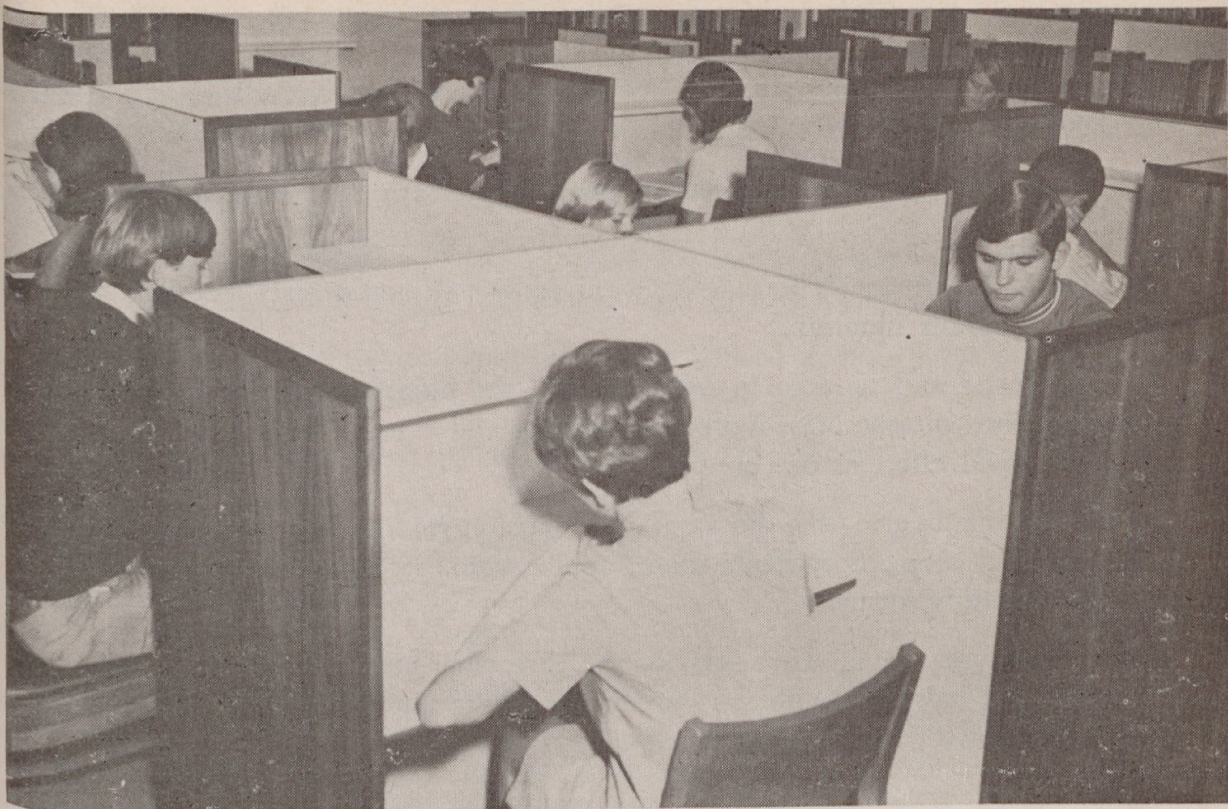
Reading Carrels at Mary Livermore Library at Pembroke State University.