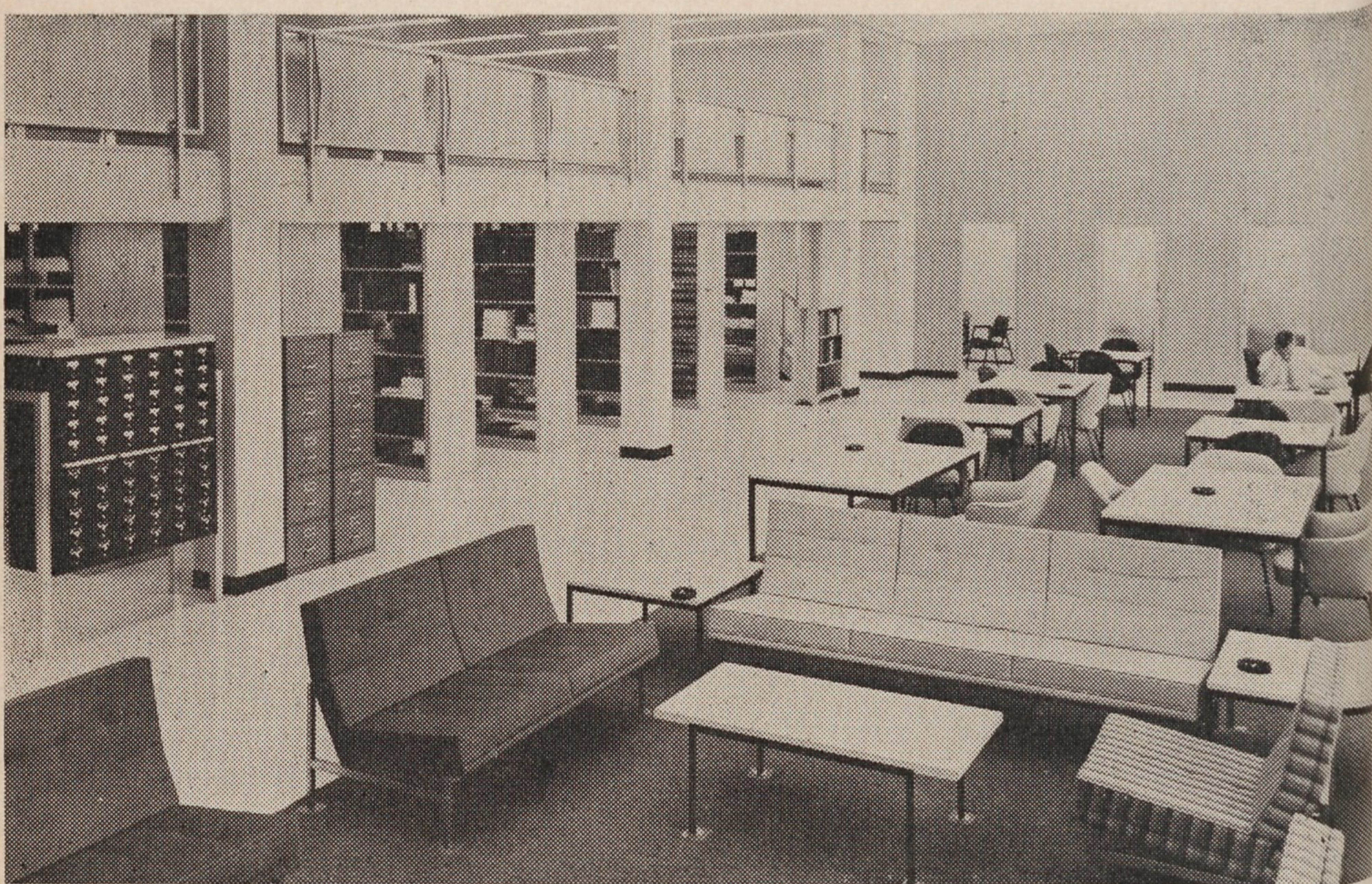
Chemstrand Library Interior

The library collection includes mainly mathematics, physics, chemistry, plastics and textiles literature, with emphasis on organic chemistry. The library subscribes to more than 300 periodical titles of which half are of foreign origin and about a third are in a foreign language. Although it is the library's policy to try to purchase everything which will be used by the Research personnel, we still obtain much material by interlibrary loan. During the past year 400 items were borrowed and the majority of the material came from the three neighboring libraries: Duke University Library, N. C. State College Library and the University of North Carolina Library. These libraries have graciously included the Research Center Library in their Interlibrary Center service which includes truck delivery of material three times a week. This service has been a great help in providing needed information for the library's patrons.