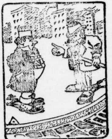
Not So Rush After All.

The graded school opened here yesterday with all the teachers present and a large enrollment of students.