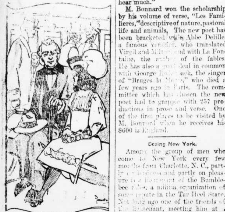
THE STATESMAN SMILED.

How a Celebrated Statesman Was Treated to a Surprise. Famous men are sometimes just like other men in the eyes of children.