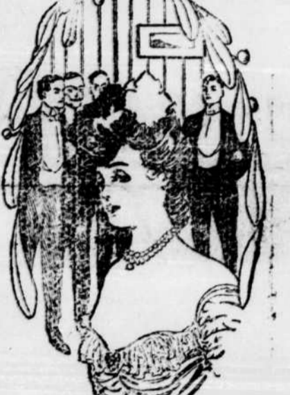
THE PATENT OF ALL WAS MARJORY DAW. Now, Shaw, I'd say the butter-I saw the coin pass— So sure was the girl in the hall (I was hung from a bracket quite close to a blue) Not more than a yard from the wall, Then he snatched beneath me, his senses alert, Till he heard the "twish twish" of a rising silk skirt. They were having a Christmas eve ball, in a rooming his arms were about the fair maid. What came to be for the wrath of papa? And he caught her cheek with his kisses in haste. But the strains of the piano afar, Put the girl a grin, reached and turned up the nose. When he saw, to his horror, alas and alas, He'd been kissing his sweetheart's mamma! When up came the guests in response to her call. While papa was quite purple with rage. And that Shaw was a cad they agreed, one and all. Not to show more respect for old age. But the strain, with her vanity utters, And quite unaware of the error, insisted That the snail should be gallantly wags. —London Sketch.

On Christmas eve, and from where I hang Tied up with a piece of string, I caught many a couple, both old and young. Kisses like anything. But faintest of all the young people I saw Was pretty Miss Evelyn Marjory Daw. Who was fit for the bride of a king. Now, Marjory Daw, as you'll readily guess, Was admired by a dozen or more, Each of whom for a kiss of the hem of her dress Would have given much treasure scarce here. But the only young man she pretended to see (He whose offer her father would never accept) Was a penniless fellow named Shaw.