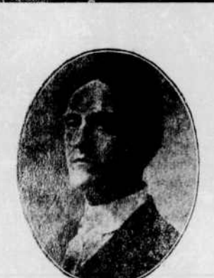
Sale Manager. The man who knows tobacco, and