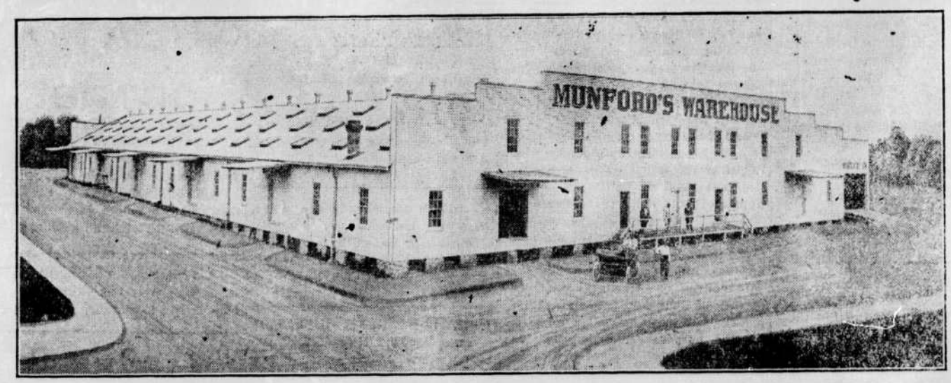
The Farmers Organization Known as the MUTUAL CO-OP-