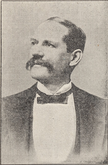
POLK MILLER, (Virginia.)