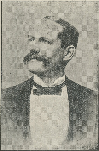
POLK MILLER, (Virginia.)