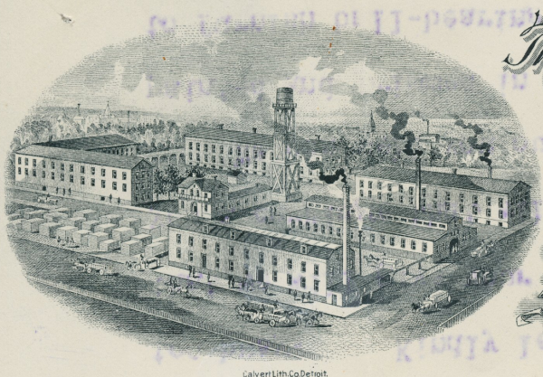
Calvert Litho Co. Detroit.