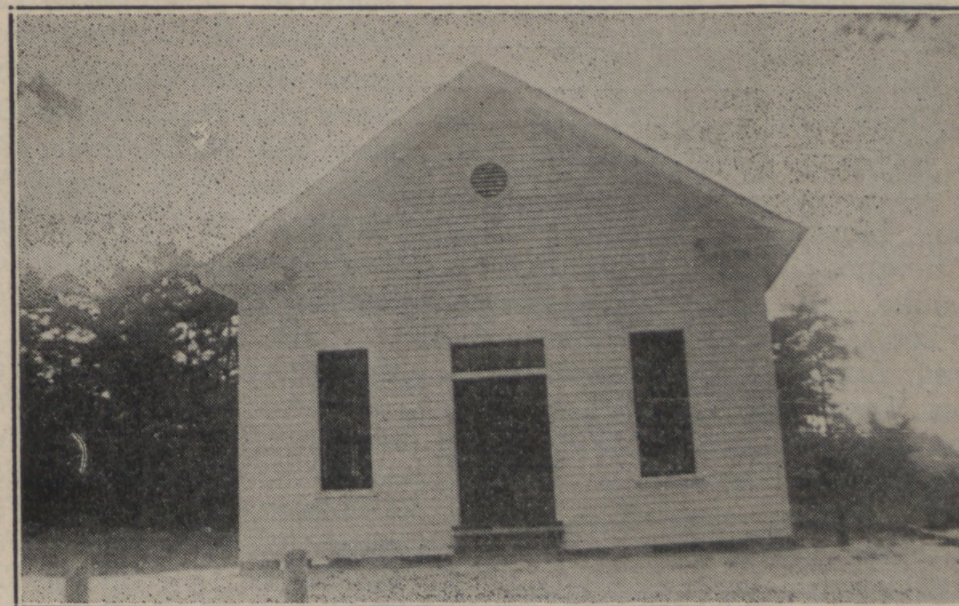
Hood Swamp Meetinghouse Meeting Set Up in ———