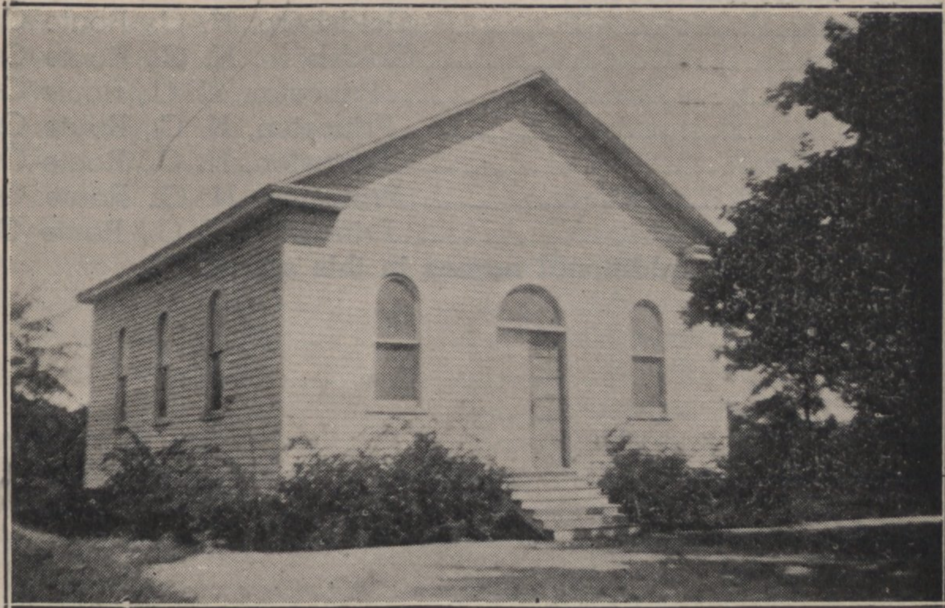
New Hope Friends Meetinghouse Meeting Set Up in 1920