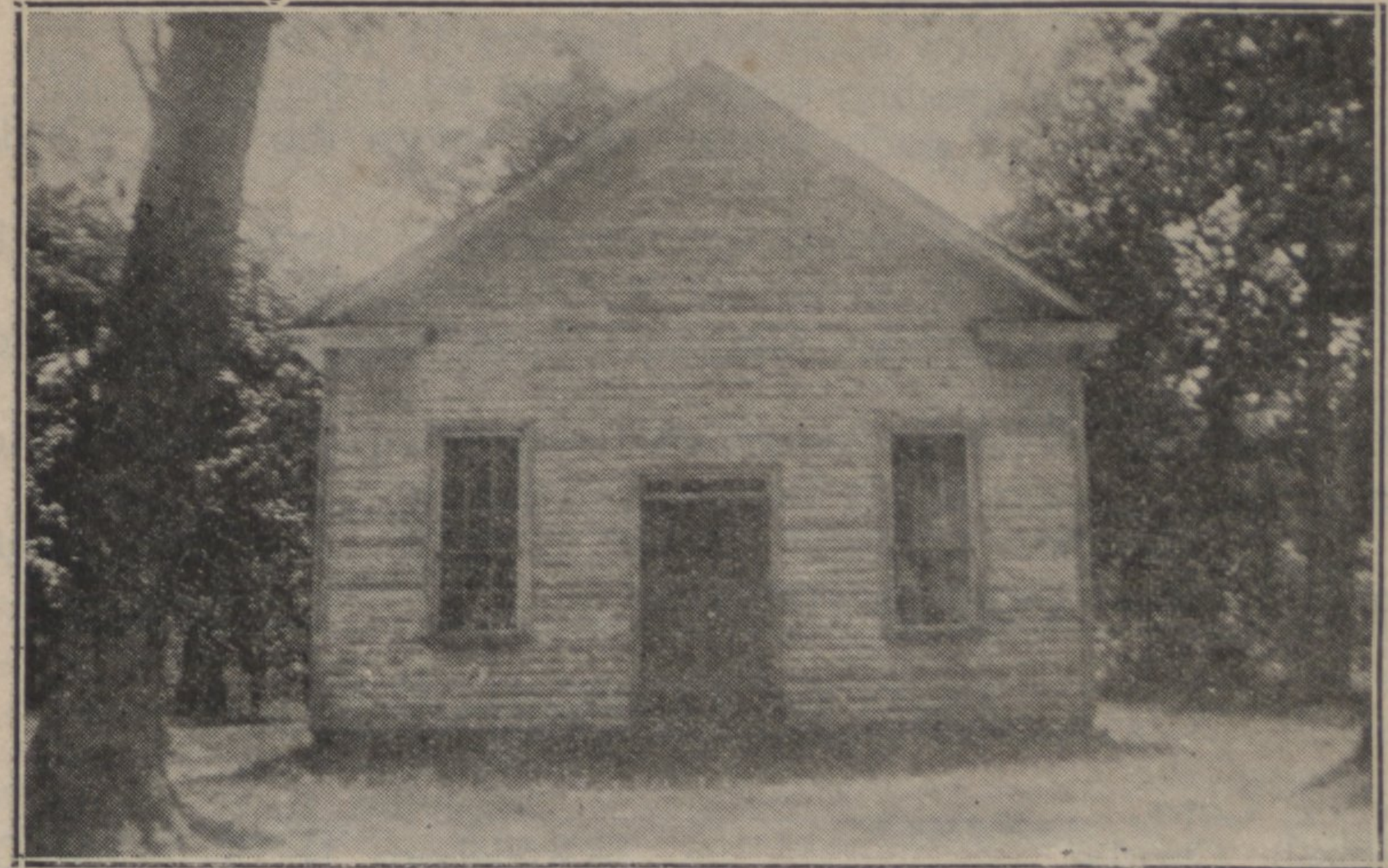
Oakland Friends Meetinghouse Meeting Set Up in 1853