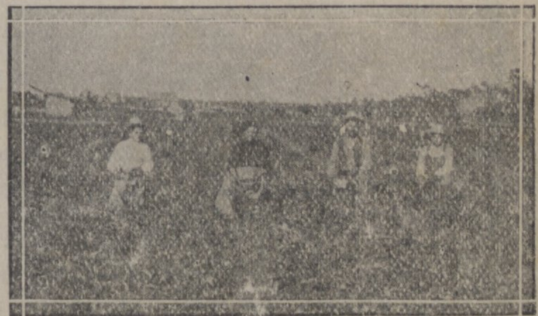
Picking Strawberries—Eastern Carolina