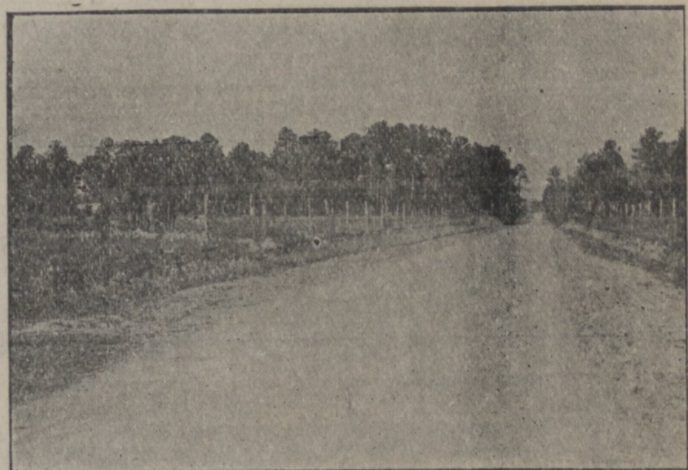
Paved Highway—Eastern Carolina

EASTERN NORTH CAROLINA INVITES YOU Eastern Carolina Chamber of Commerce, Inc.