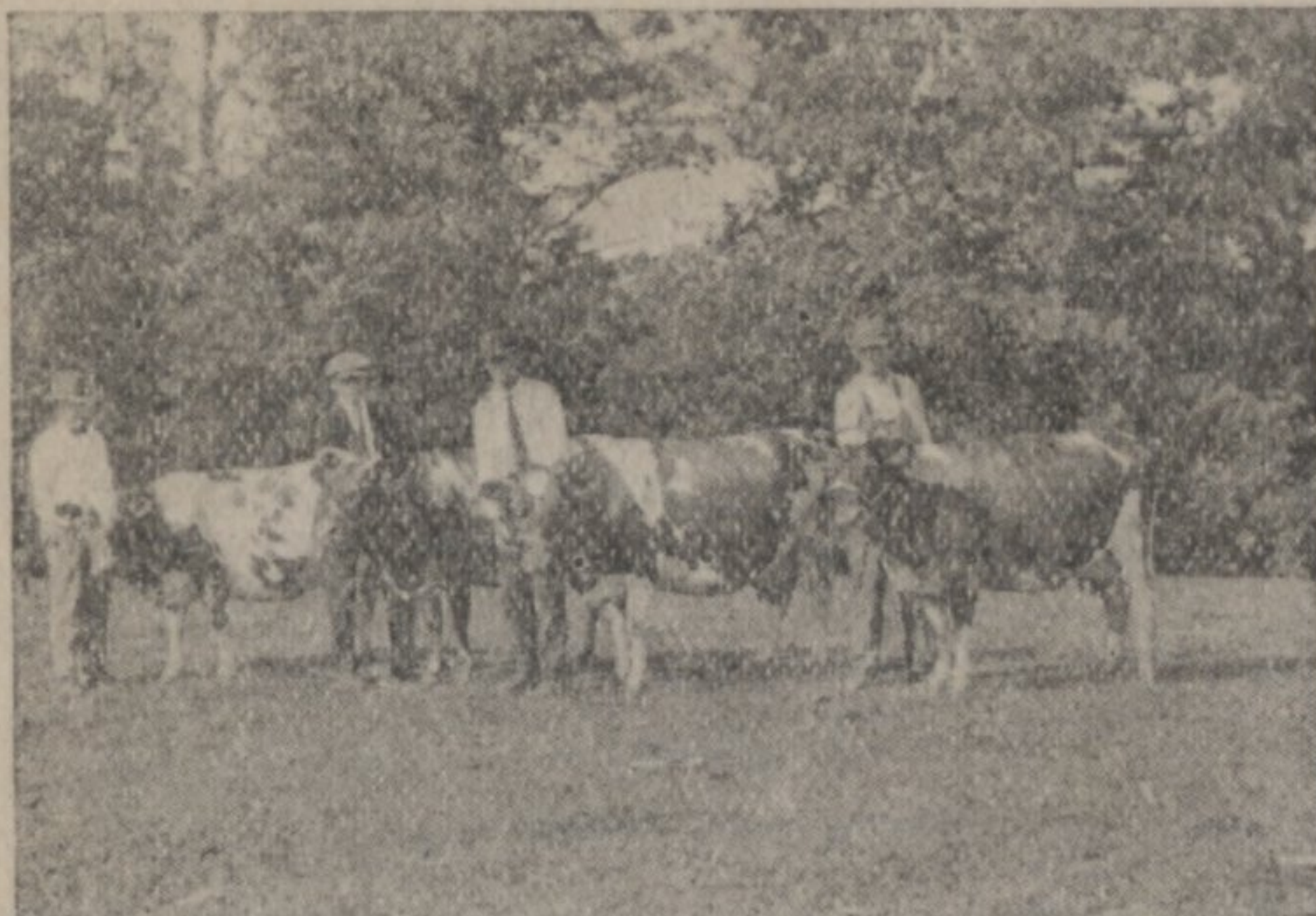
Dairying Profitable—Eastern Carolina