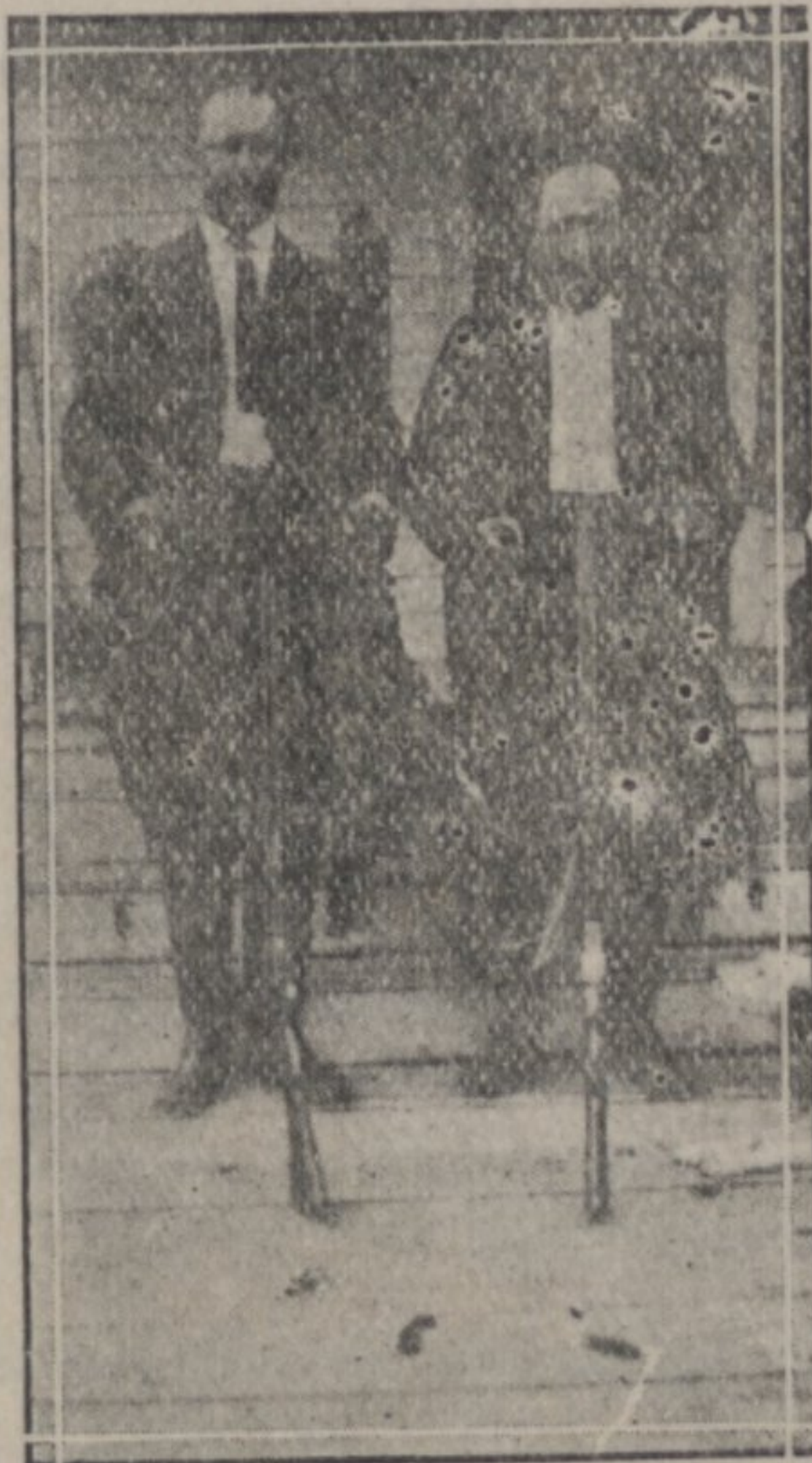
Wild Game Plentiful in Eastern Carolina