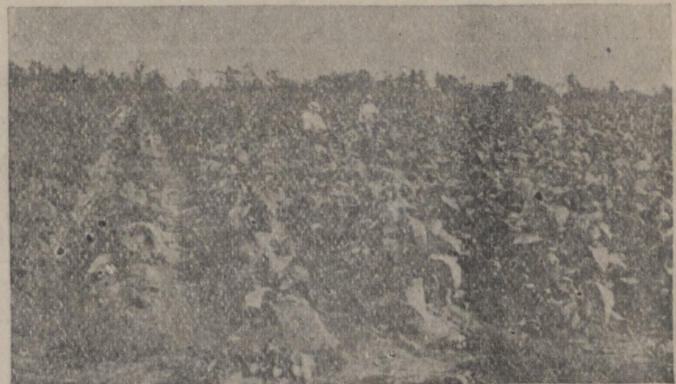
Tobacco Field—Eastern Carolina