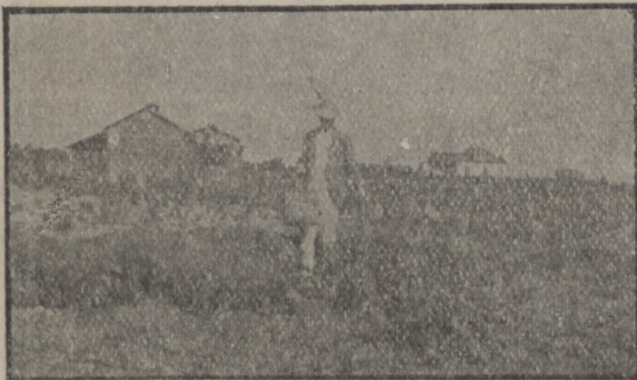
A Real Industry—Eastern Carolina