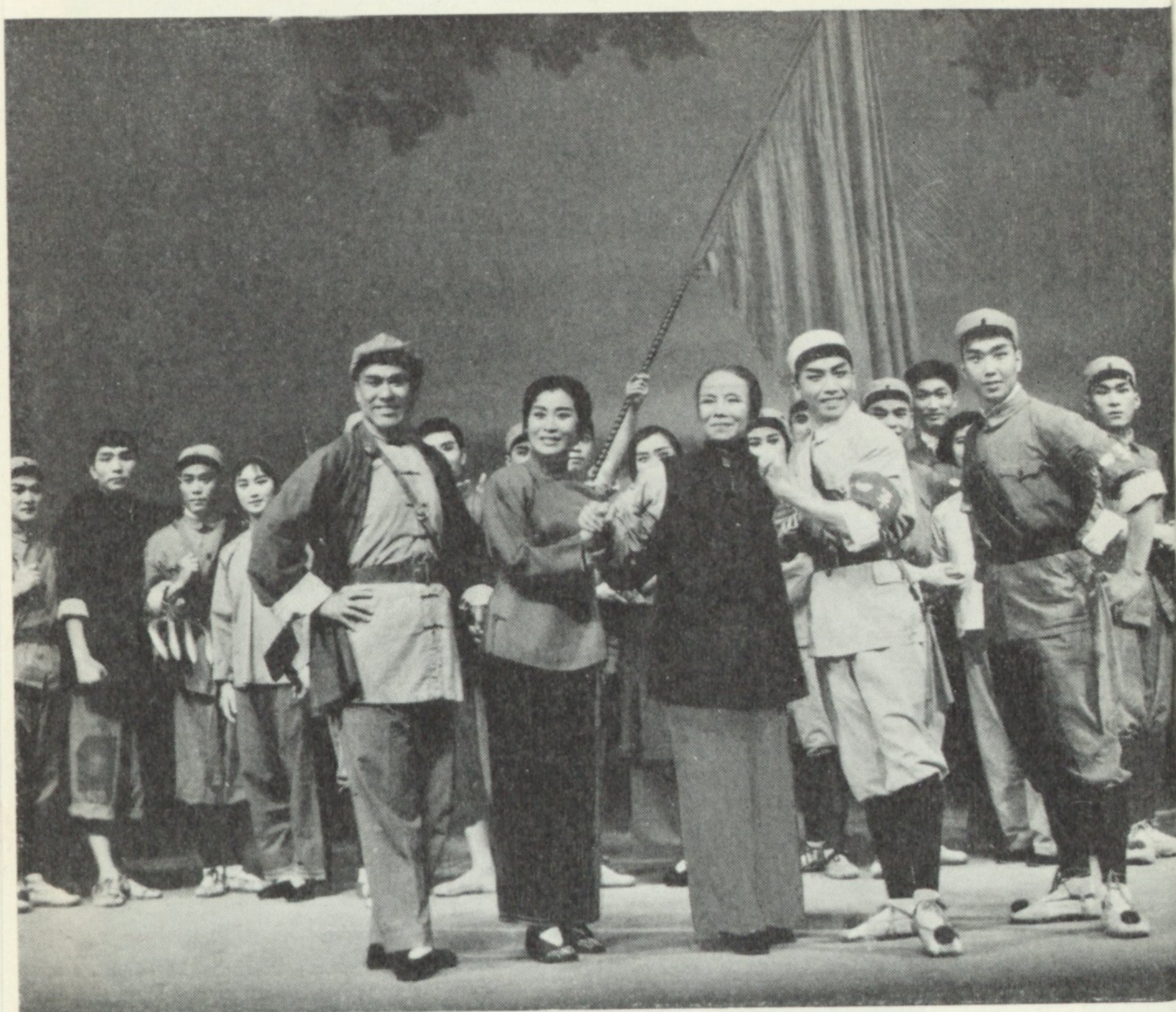
"Wiping out the enemy"