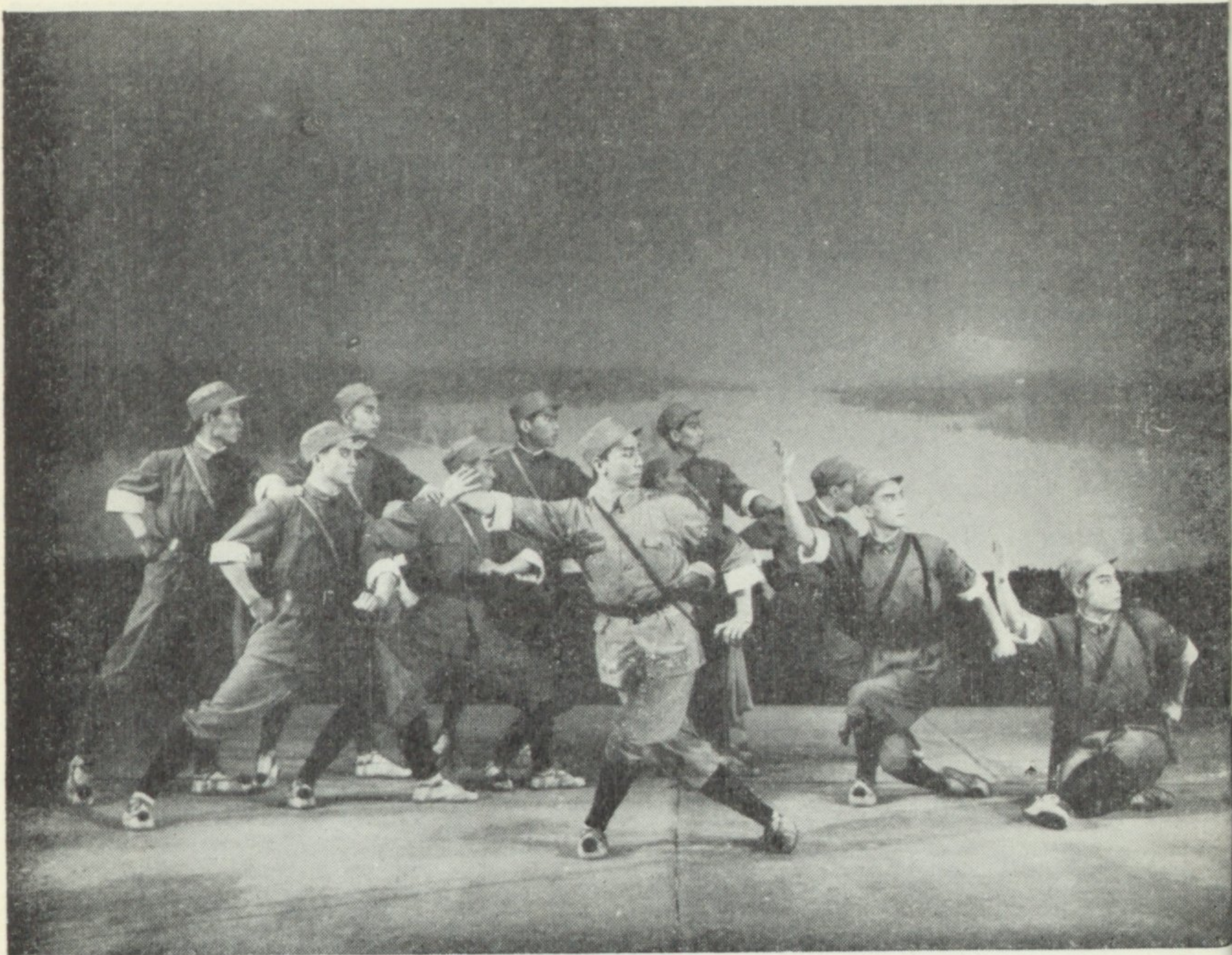
"Preparing for the attack"