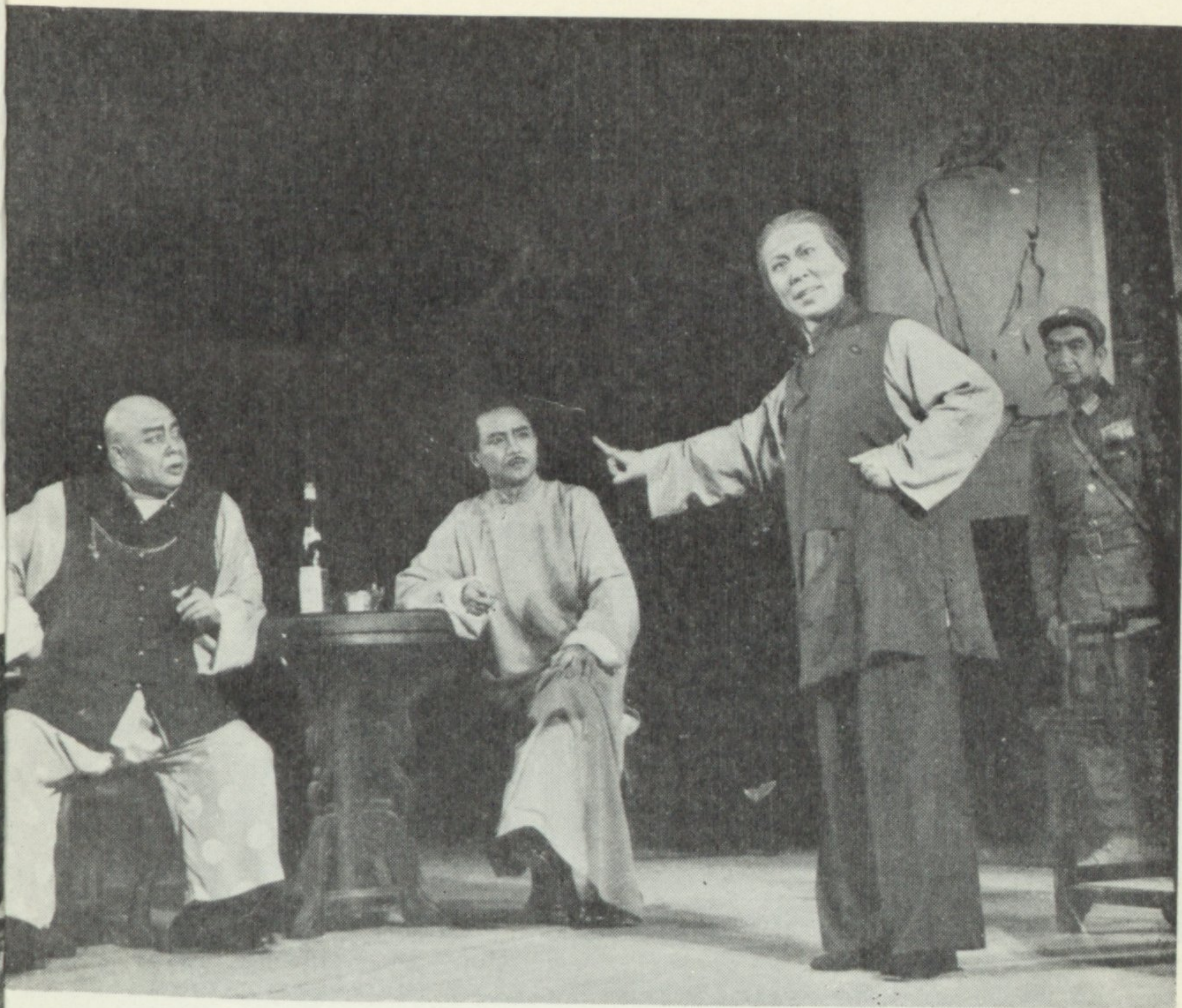
"Denouncing the enemy"