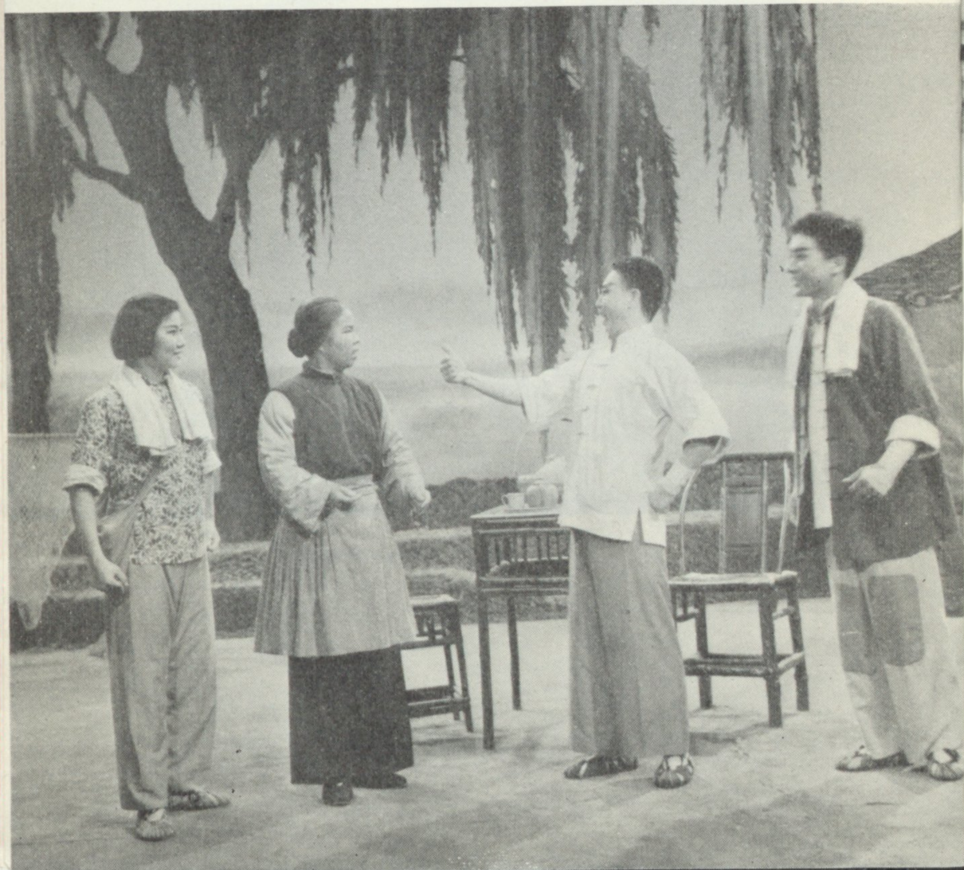
"Leaving the village"