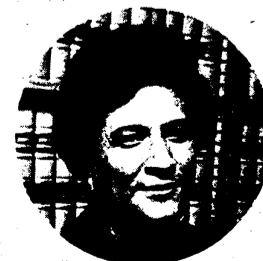
Constance Baker Motley

Mrs. Motley has always had a desire to help her fellowman. Serving as a federal judge, she now has a chance to illustrate her services and to prove she is capable of fulfilling all of her duties.