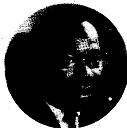
Martin Luther King