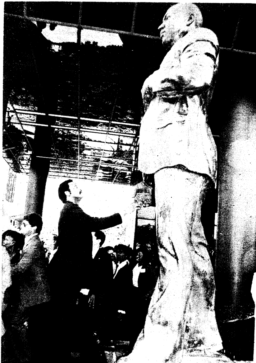
■ The Dream Lives: Continuing on the campaign trail, Jesse Jackson, who is making his bid for the Democratic nomination for president, reflects briefly before a statue of his mentor, the late Dr. Martin Luther King Jr., outside of City Hall in San Bernardino, Calif.

In his speech, Richard Pryor highlighted some of the achievements of Dr. King and of those who worked closely with him. Pryor explained that this was his first and his last serious speech. He, then, added, "I'm just doing this for Dr. King today. Today only."