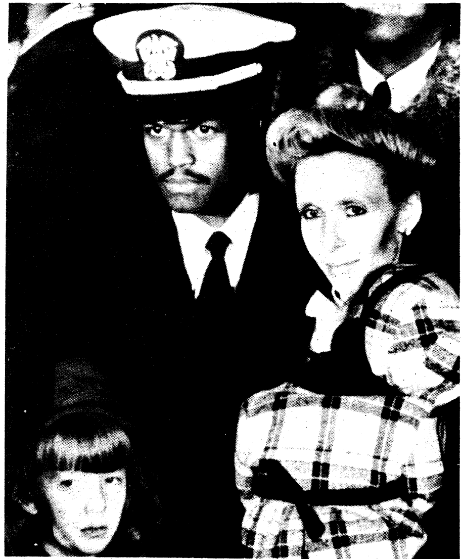
TAKEN FROM DAILY REFLECTOR

Jackson's humanitarian move showed his pervasive power, and placed him in the mainstream of the Democratic presidential race as well as making him, in public opinion, a good candidate for vice presidency also. Jackson represents direct and vigorous action in support of what is right. The Syrian incident further proves that Jackson can go where Reagan fail to go or could in view of foreign policies. Jackson's trip to Syria was a statement of true leadership that proved him an able politician. In view of past mass demonstrations for civil rights against discrimination, Jackson if