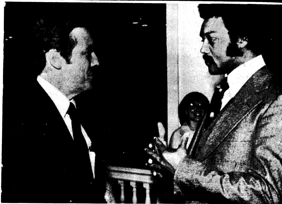
G.O.P. Chairman Bill Brock (left) and the Rev. Jesse Jackson at Washington meeting

The film is sponsored by the Minority Arts Committee. All students are cordially invited to attend. Admission is by I.D. and Activity Card or Mendenhall Student Center membership card. Popcorn and soft drinks will be served. Don't be late, for space is available for only 35 to 40 people.