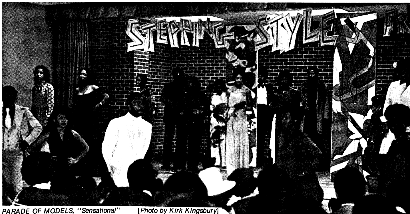
PARADE OF MODELS, "Sensational"

Upcoming S.O.U.L.S. events include an art exhibit tentatively set for the spring and an outdoor picnic or pig-pickin' but these events will be held upon the discretion of the new S.O.U.L.S. president and members.