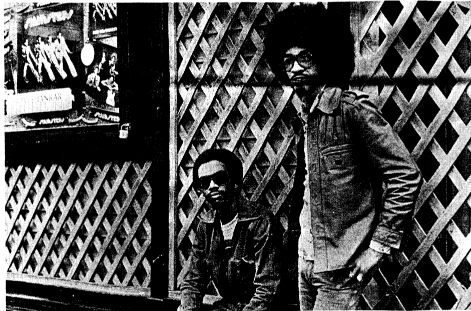
BROTHERS JOHNSON being cool.