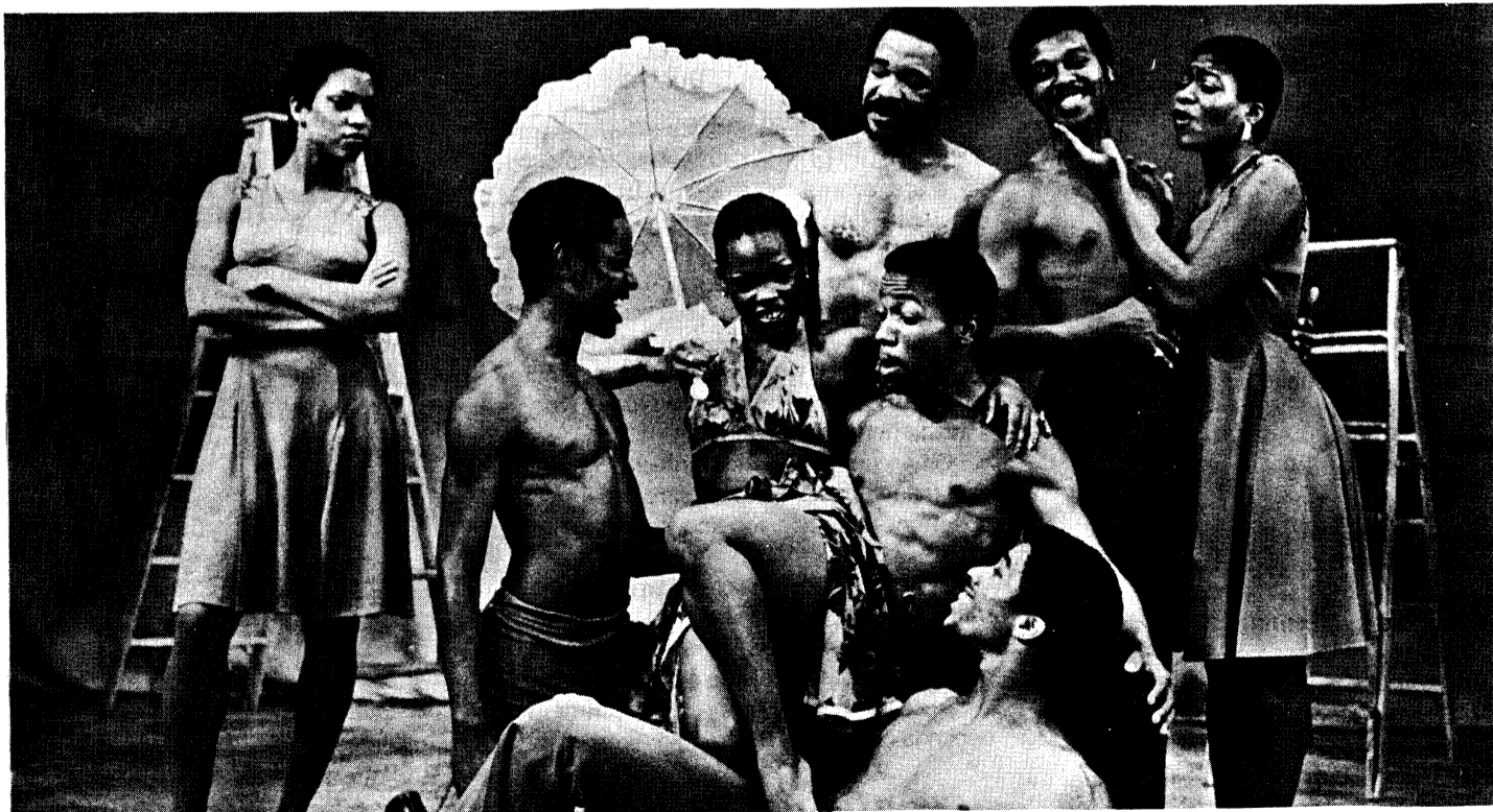
"DON'T BOTHER ME..."