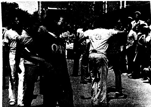
OMEGA PSI PHI fraternity stepping during Spring 1976 block show. The members of the Omega fraternity are,

Following the deadline for letters, the applicants are screened and initiated into the Lampados Club if they meet specific club requirements.