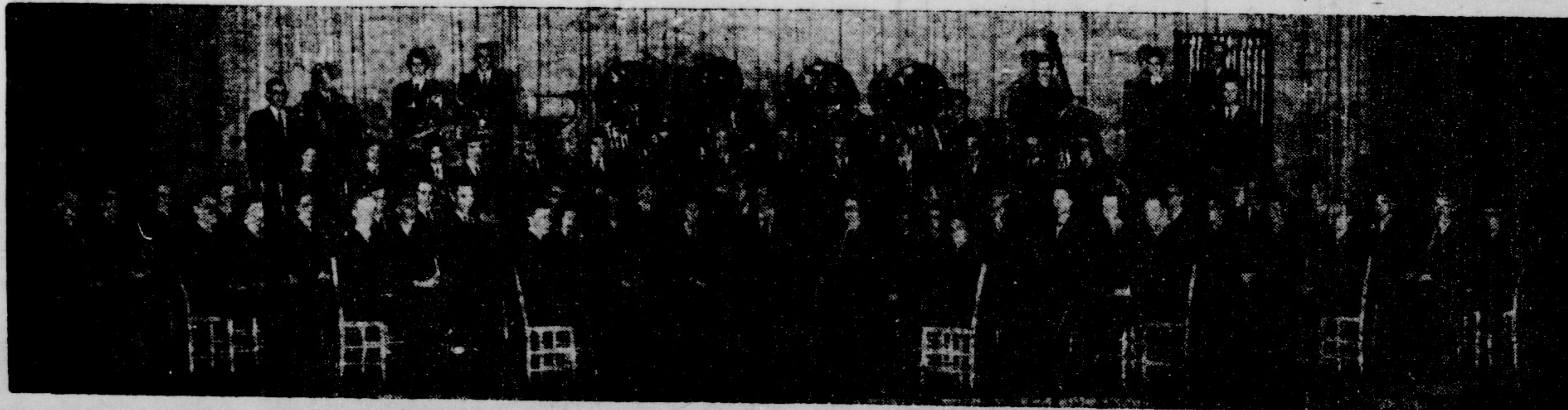
ECC band to present its annual spring concert on May 8, in McGinnis Auditorium.