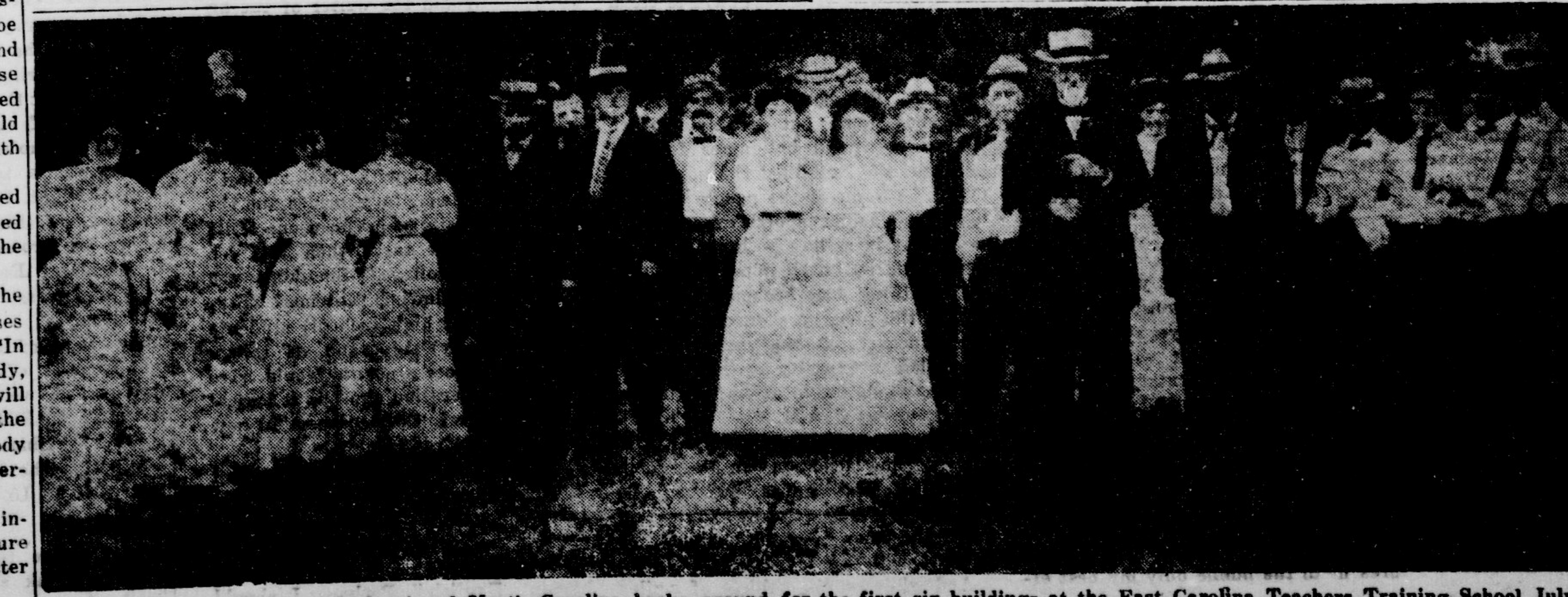
Ex-Governor Thomas J. Jarvis of North Carolina broke ground for the first six buildings at the East Carolina Teachers Training School July 2, 1908. Pictured above with those who were present for the exercises, Gov. Jarvis holds the spade, now a treasured possession of the college, which he used that day and which in the Golden Anniversary Pageant to be presented at East Carolina College May 3 and 4 becomes a symbol of the progress made by the institution over the past fifty years.