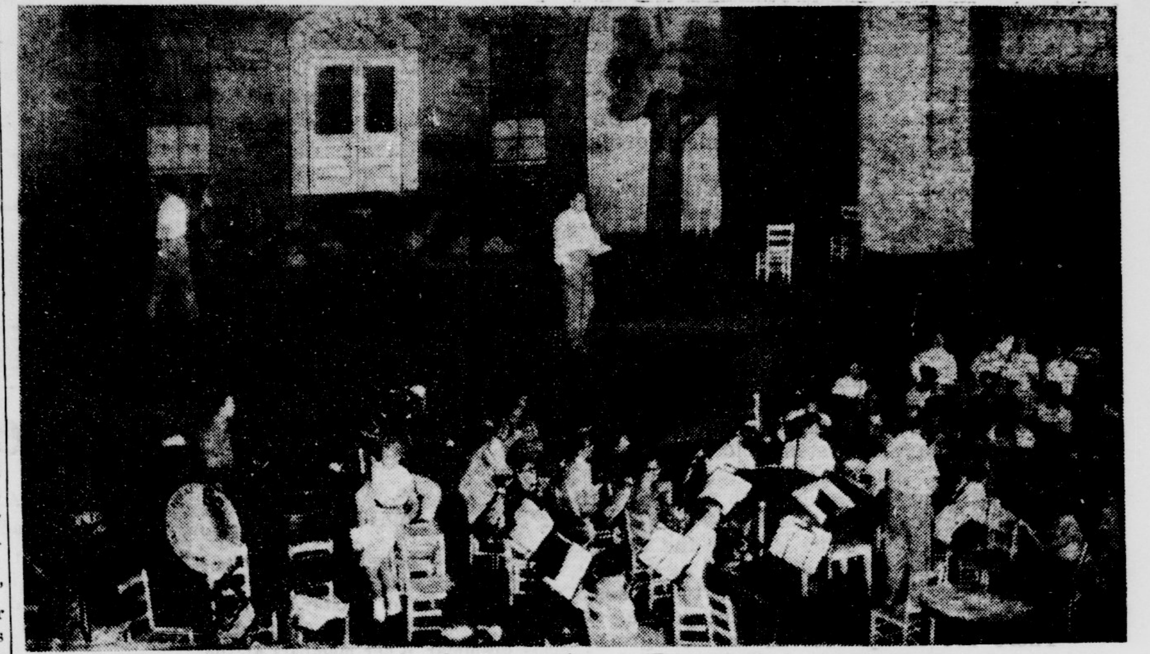
Musicians rehearse for the presentation of "East Carolina's Spade: To Serve."

The East Carolina Orchestra, the college concert band, and three student choral groups will provide a musical background. Specially designed settings and costumes appropriate to the