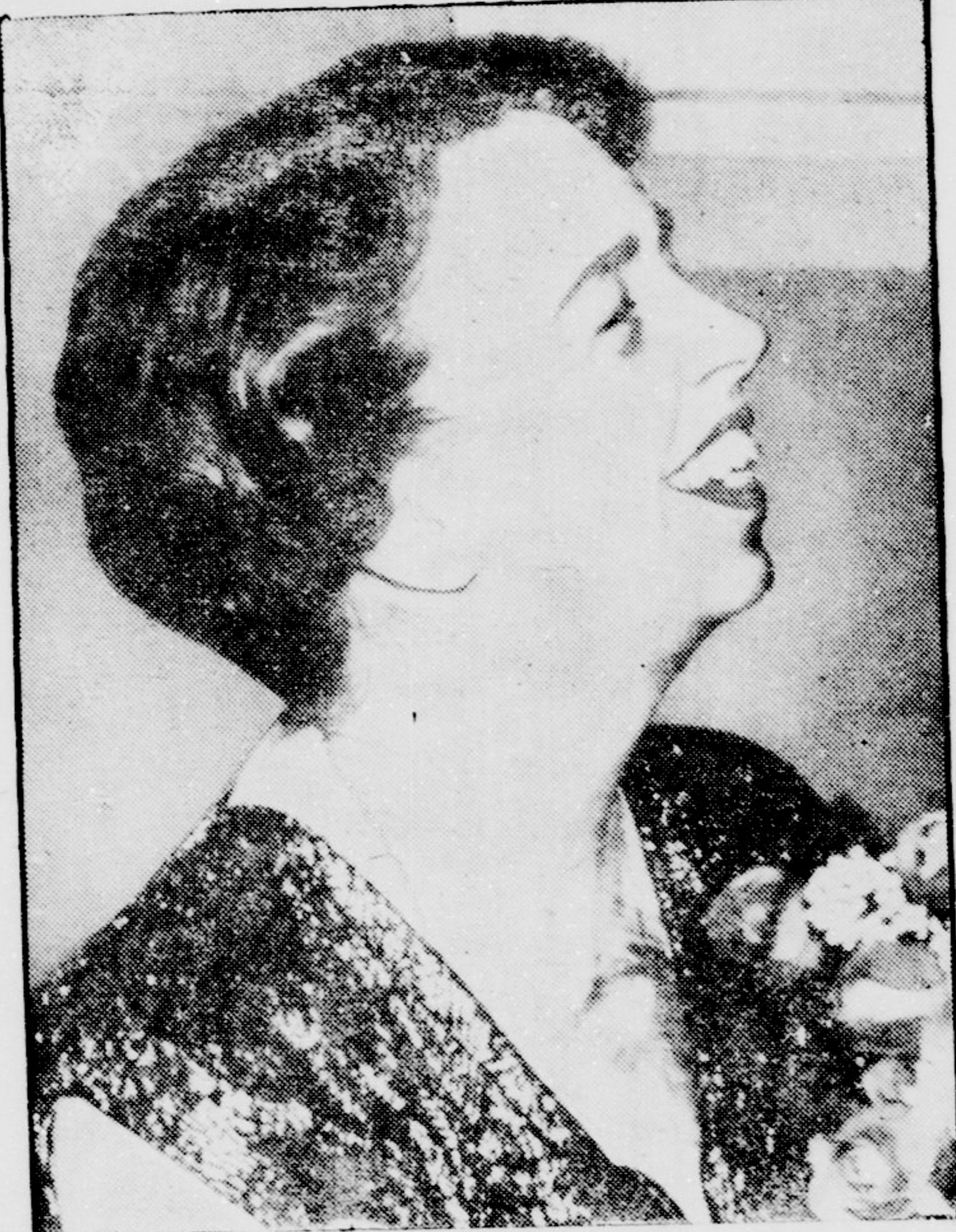
Mrs. Eleanor Roosevelt