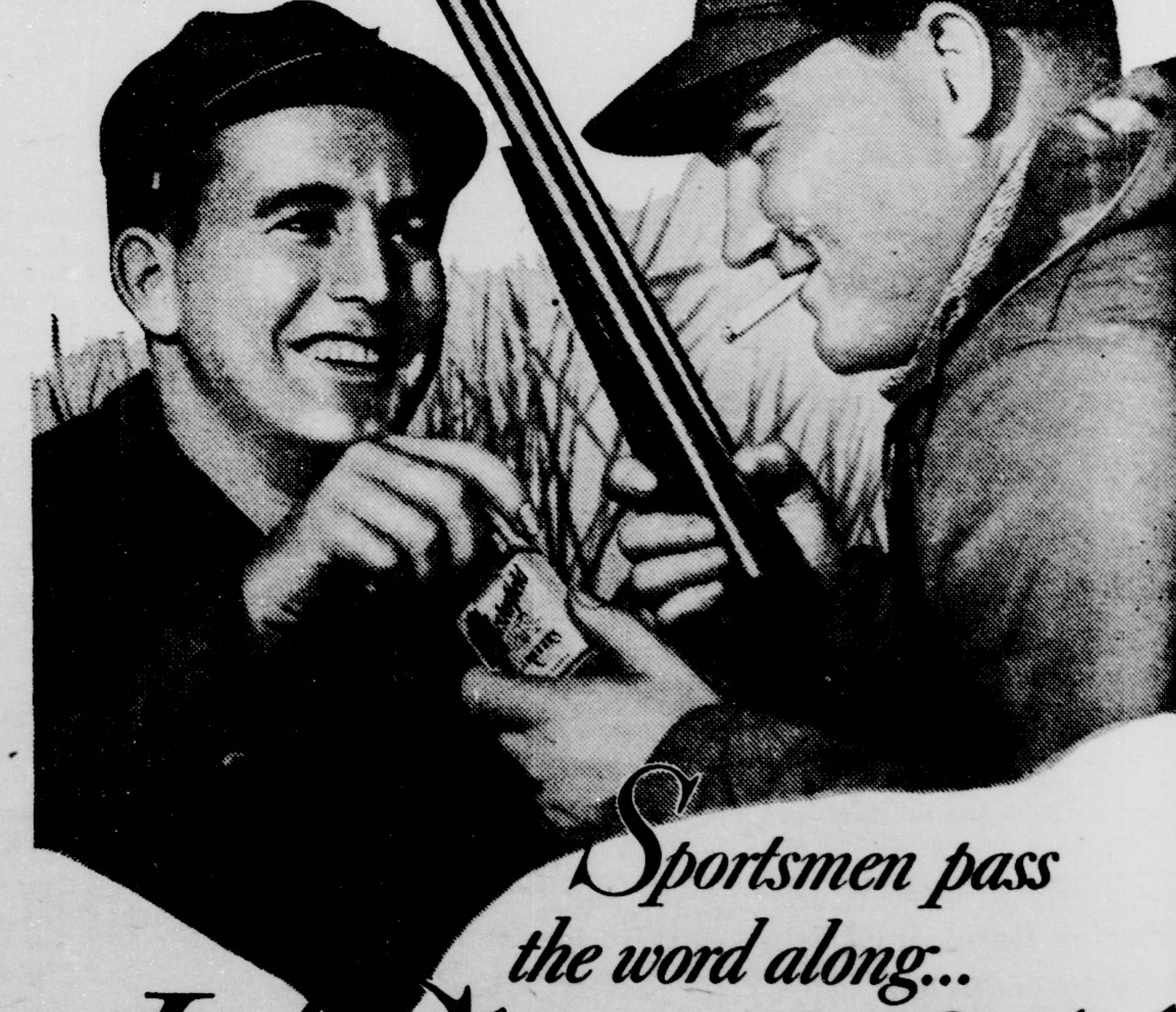
JOHNNY MIZE and MORTON COOPER St. Louis Cardinals' first baseman and pitcher. They play ball together, hunt together, and together enjoy Chesterfield—the cigarette that Satisfies.